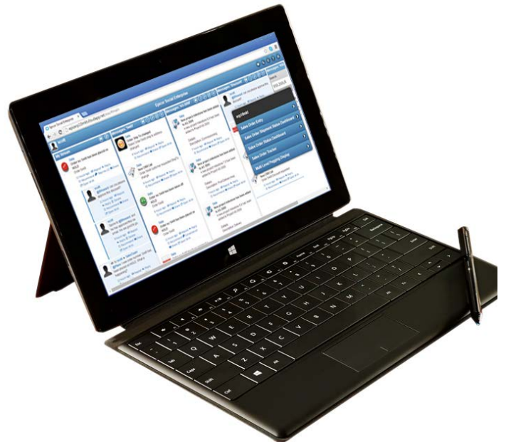
Figure 2: Access your information on the go.

With the proliferation of mobile devices and the increase in geographically distributed virtual organizations, users are no longer tied to the office. Self-service enterprise social collaboration is no longer an option, it is a must. Allowing users to subscribe to the information that they want or need, when they want this is essential to maintaining a happy workforce.