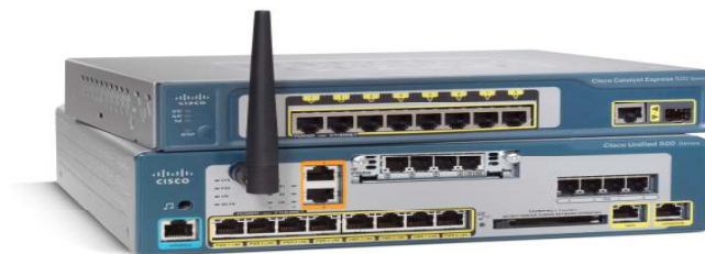
Figure 2. Cisco Unified Communications 500 Series—32/48 User Configuration